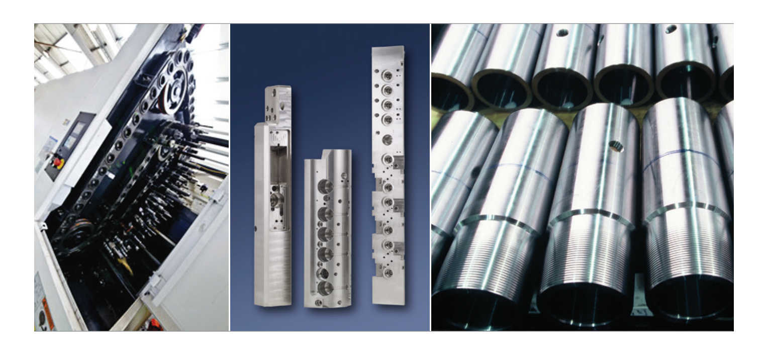
Hunting's Manufactured Products Are Built to Meet Your Costs and Operational Specs