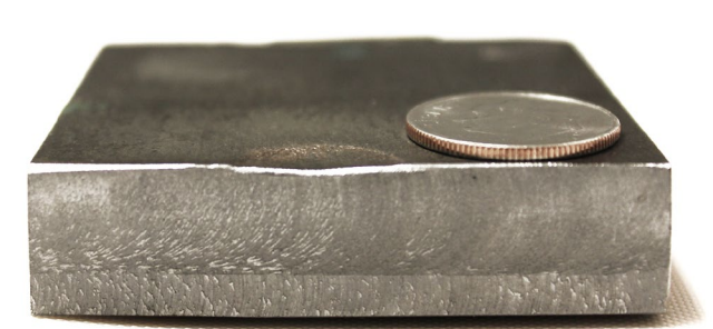
Tested for minimal impact at 0.25 in. (6.35 mm) standoff