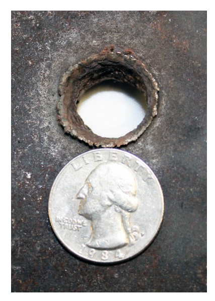
60% improvement over previous circulating charges