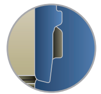
Internal torque shoulder, metal-to-metal seal and lubricant relief groove