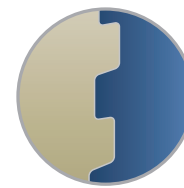
Hooked thread design