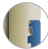
External torque shoulder