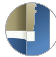
Metal-to-metal seal with optional seal ring for plastic-coated applications